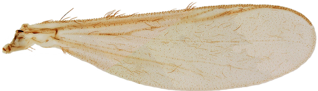
FIGURE 4. Paraphrotenia valdiviensis sp. n., male. Wing.