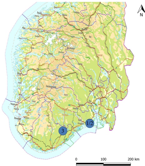
FIGURE 2. Map of southern Norway showing the locations where T. pallidulus (McLachlan, 1878) were found.

small open area mainly surrounded by forest. The current was moderate to fast and the substrate was stony.