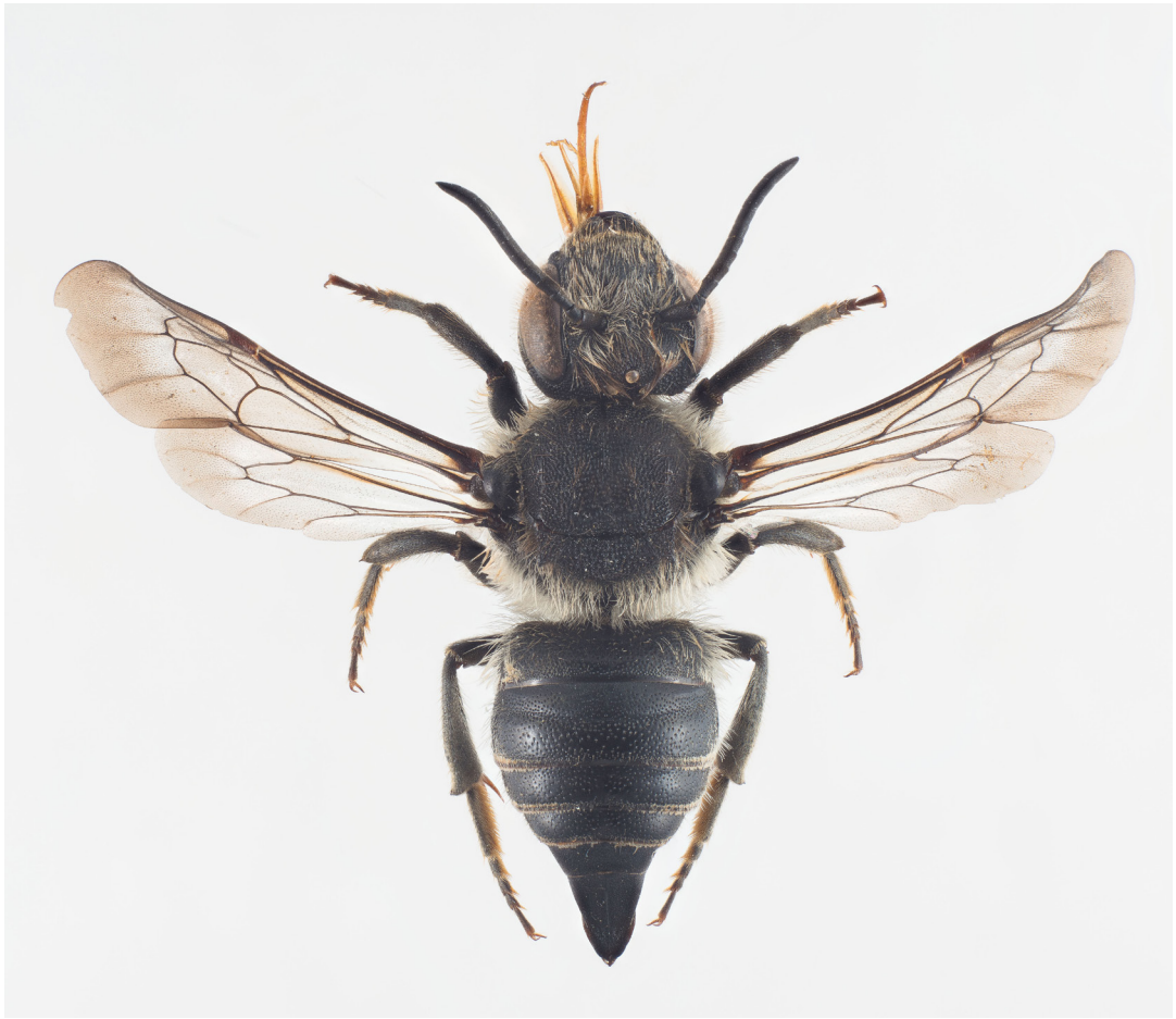
FIGURE 1. Female Coelioxys lanceolata Nylander, 1852 from Sør-Fron, Oppland county.

and is currently considered, vulnerable (VU) in Finland (Rassi et al. 2010), near threatened (NT) in Sweden (ArtDatabanken 2015) and critically endangered (category 2) in Germany (Scheuchl & Schwenninger 2015). In the Nordic countries only 42 unique observations, i.e. non-overlapping localities, are reported in the GBIF database (GBIF Secretariat 2017): 10 in Finland (4 since 1990), 26 in Sweden (13 since 1990), and four in Norway (all since 1990).