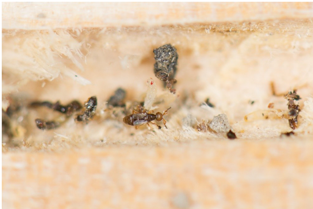
FIGURE 5. Male of Melittobia acasta (Walker, 1839) in a bee nesting hole in Trøndelag, Malvik.