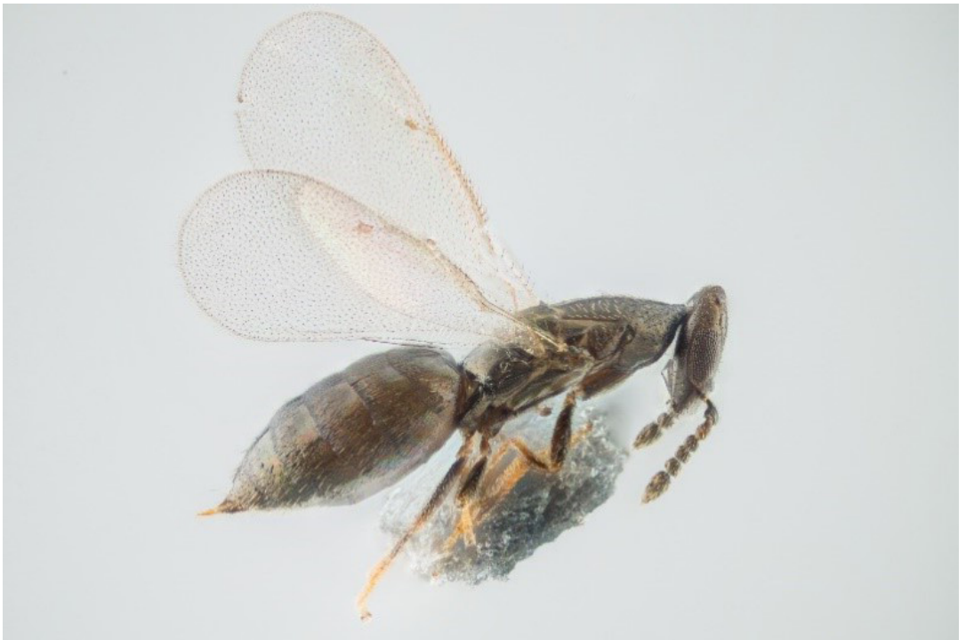
FIGURE 3. Female Melittobia acasta (Walker, 1839) from Trøndelag, Malvik.