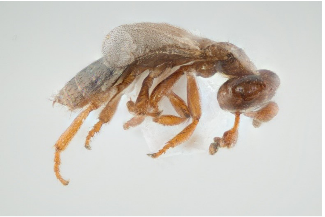
FIGURE 6. Male of Melittobia acasta (Walker, 1839) from Trøndelag, Malvik.