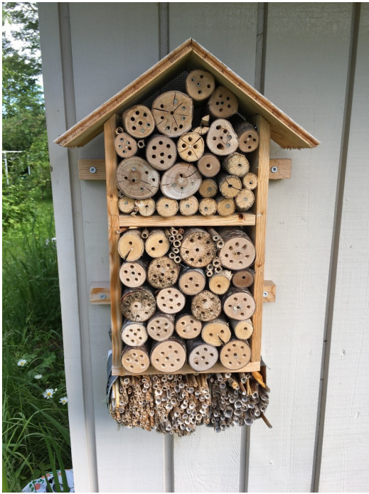
FIGURE 1. Insect hotel at the locality in Malvik, Trøndelag, where Melittobia acasta (Walker, 1839) had infested several holes.