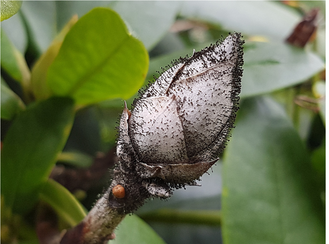
FIGURE 5. Seifertia azaleae (Peck) Partr. & Morgan-Jones on a Rhododendron flower bud.