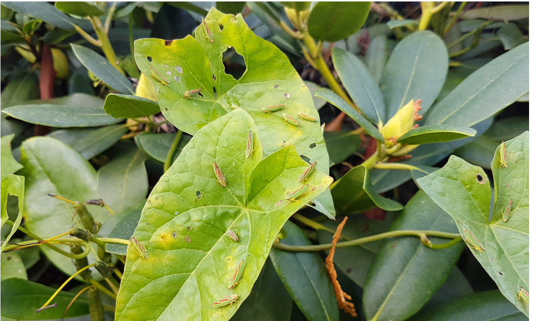
FIGURE 9. A food plant shift by Graphocephala fennahi from Rhododendron to Calystegia sepium was observed on a locality in Norway during the autumn 2017. On the photo, about 20 individuals can be seen on leaves of Calystegia sepium and none on the surrounding Rhododendron leaves.

Collectors and gardeners of Rhododendron might have had it in private gardens for years, unavailable for researchers. The same would probably apply to Sweden, where its presence was first commented as late as 2016 (Svensson 2016), and where it so far only is reported from a few localities around Helsingborg and Göteborg (Artportalen 2017). The species has a large distribution range in Norway along the coast from Østfold to Hordaland counties, but the infected Rhododendron specimens are rather scattered. In groups of Rhododendron , only one or a few specimens/cultivars might be affected as reported by several authors (e.g. Garibaldi et al. 2001) and as seen on the localities Ås and Bragernes kirkegård reported here. The latter is a cemetery of about 4,5 ha with many Rhododendron specimens scattered around. A superficial survey revealed that eggs of the hopper were present on most of the Rhododendron specimens around the cemetery while bud blast only was found on the one corner of the cemetery, with two single blasted buds on two specimens being the exception. This locality