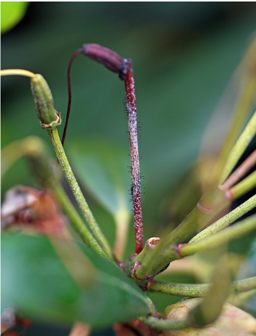
FIGURE 7. Seifertia azaleae on a pedicel of Rhododendron .

majority of the Rhododendron species (15) have Asian origin (mainly China, Japan, Burma and India), while nine are of Nearctic origin. Most of the species (15) are found in the Ponticum section. This given section of Rhododendron would refer to the Ponticum Series according to the Balfour System or Subsection Pontica according to the Cullen-Chamberlain System (Gelderen & Hoey Smith 1992). 69 of the 104 hybrids can be allocated to 12 of the 18 “groups” given in Gelderen & Hoey Smith (1992). 40 % of those (28) are in subgroup 2a ( R. catawbiense and hybrids), 16 % (11) are in subgroup 1a ( R. ponticum and hybrids), and 14 % (10) in subgroup 4a ( R. arboreum and hybrids). If scoring the sensibility to S. azaleae relatively from 1–3 (low – high occurrence) based on the papers cited above, 19 of the hybrids are reported with a high occurrence, eight in subgroup 2a and five in subgroup 4a.