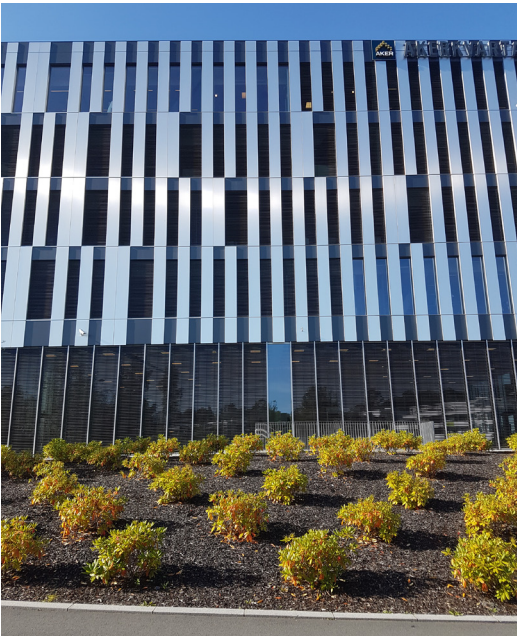
FIGURE 8. A modern habitat of Graphocephala fennahi in Bærum municipality. The locality had newly planted (2015–2016) Rhododendron and a small population of G. fennahi , probably introduced there with the plants. Photo: A. Endrestøl.

Collectors and gardeners of Rhododendron might have had it in private gardens for years, unavailable for researchers. The same would probably apply to Sweden, where its presence was first commented as late as 2016 (Svensson 2016), and where it so far only is reported from a few localities around Helsingborg and Göteborg (Artportalen 2017). The species has a large distribution range in Norway along the coast from Østfold to Hordaland counties, but the infected Rhododendron specimens are rather scattered. In groups of Rhododendron , only one or a few specimens/cultivars might be affected as reported by several authors (e.g. Garibaldi et al. 2001) and as seen on the localities Ås and Bragernes kirkegård reported here. The latter is a cemetery of about 4,5 ha with many Rhododendron specimens scattered around. A superficial survey revealed that eggs of the hopper were present on most of the Rhododendron specimens around the cemetery while bud blast only was found on the one corner of the cemetery, with two single blasted buds on two specimens being the exception. This locality