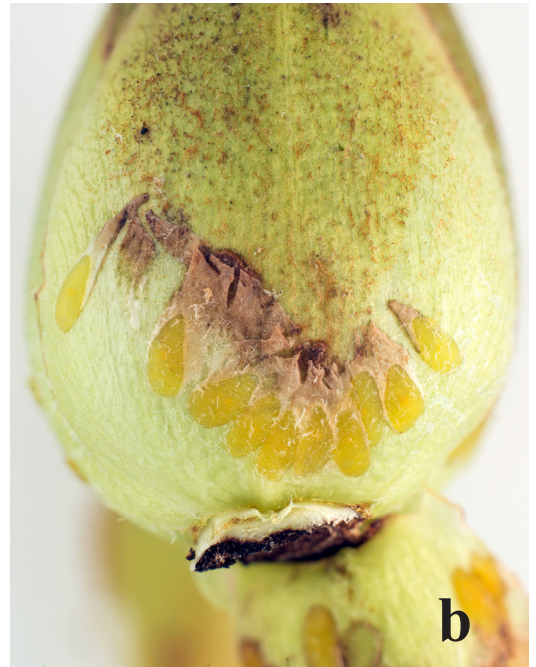
FIGURE 3. Eggs of Graphocephala fennahi are about 1.8–2.0 mm long, 0.7 mm width, oval/piriform, yellow and often deposited in fan-shaped groups under the epidermis of perulae of Rhododendron flower buds.