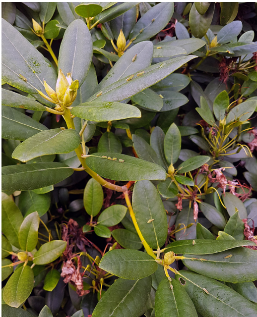
FIGURE 4. About 25 individuals of Graphocephala fennahi feeding on Rhododendron . The majority are lined up along the middle vein on the upper side of the leaves.

Giustina (1989) and Nickel (2003) states that the nymphs most likely are monophagous on Rhododendron even though adult individuals might be found on other plants (as reported by e.g. Sergel 1987b, Niedringhaus & Olthoff 1986, Vidano et al. 1987, Whitehead 2005). Nymphal development on other plants (e.g. Callistephus chinensis (L.) Nees, Castanea sativa Mill., Malus Mill., Populus L., Robinia pseudoacacia L., Tilia L.) have been documented under controlled environments (Morcos 1953, Vidano et al. 1987). The evidence for an extended host plant range is so far not convincing, even though adults are found on a broad range of food plants surrounding Rhododendron (Vidano et al. 1987). To my knowledge, eggs and nymphs are so far only reported from Rhododendron under natural conditions.