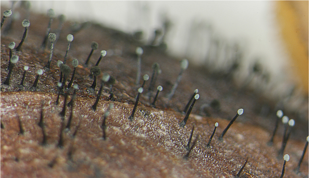
FIGURE 6. Seifertia azaleae with each synnemata containing a robust, dark brown stipe, up to 0.5–2.5 mm long and nearly 200–500 \mu\text{m} in diameter, terminated by a spherical or ovoid, powdery head.