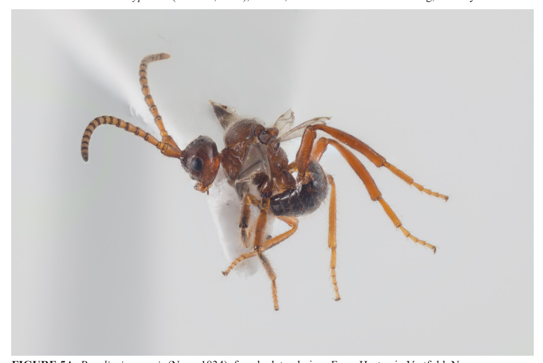
FIGURE 5A. Paralipsis enervis (Nees, 1834), female, lateral view. From Horten in Vestfold, Norway.