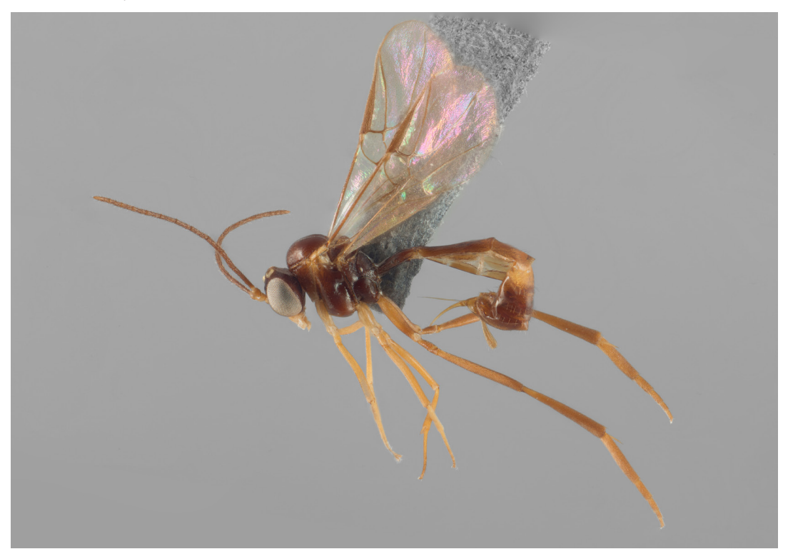
FIGURE 6. Hybrizon buccatus (de Brébisson, 1825), female. From Jomfruland in Telemark, Norway.