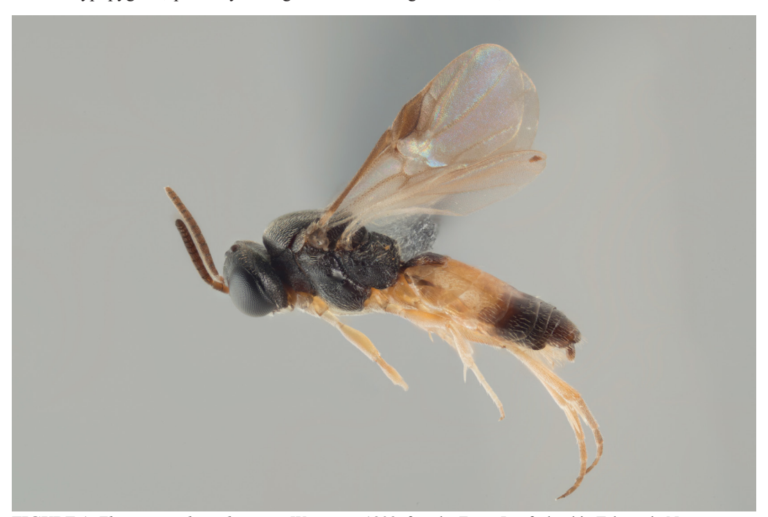
FIGURE 1. Elasmosoma luxemburgense Wasmann, 1909, female. From Jomfruland in Telemark, Norway.

Material. BUSKERUD eastern [BØ], Lier: Toverud [EIS 28, N59.92003° E10.34197°], 1♂ (Figure 2A), 1 September–2 October 2014, MT, leg. FØ & OH, coll. NINA; SØR-TRØNDELAG coastal [STY], Snillfjord: Moldtun [EIS 91, N63.564836° E9.483737°], 2♀♀ 17 August 2016, sweep netting, (Figure 2B), leg. AS, coll. NINA; FINNMARK eastern [FØ], Sør-Varanger: Gjøkåsen [EIS160, N69.159816° E29.209926°], 8♂♂, 23 June–11 July 2016, MT, leg. FØ & OH, coll. NINA; FINNMARK interior [FI], Karasjok: Skarfánjunni [EIS167, N69.4394155° E25.837304°], 2♂♂, 26 June–12 July 2016, MT, leg. FØ & OH, coll. NINA.