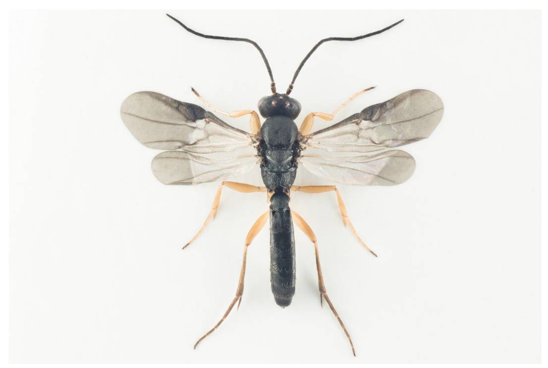
FIGURE 3A. Neoneurus auctus (Thomson, 1895), female. From Malvik in Sør-Trøndelag, Norway.