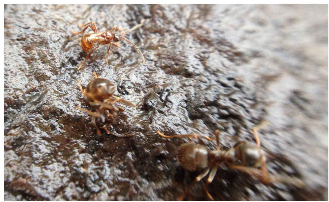
FIGURE 5B. Paralipsis enervis (Nees, 1834) together with Lasius niger (Linnaeus, 1758). From Horten in Vestfold, Norway.