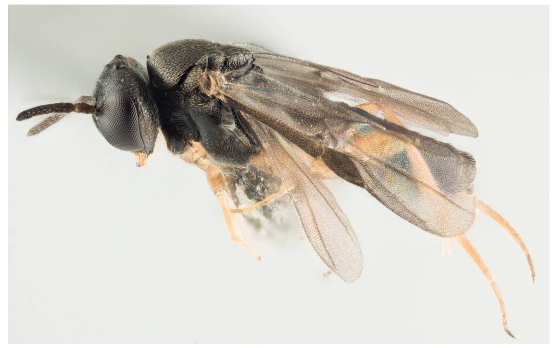
FIGURE 2B. Elasmosoma berolinense Ruthe, 1858, female. From Snillfjord in Sør-Trøndelag, Norway.