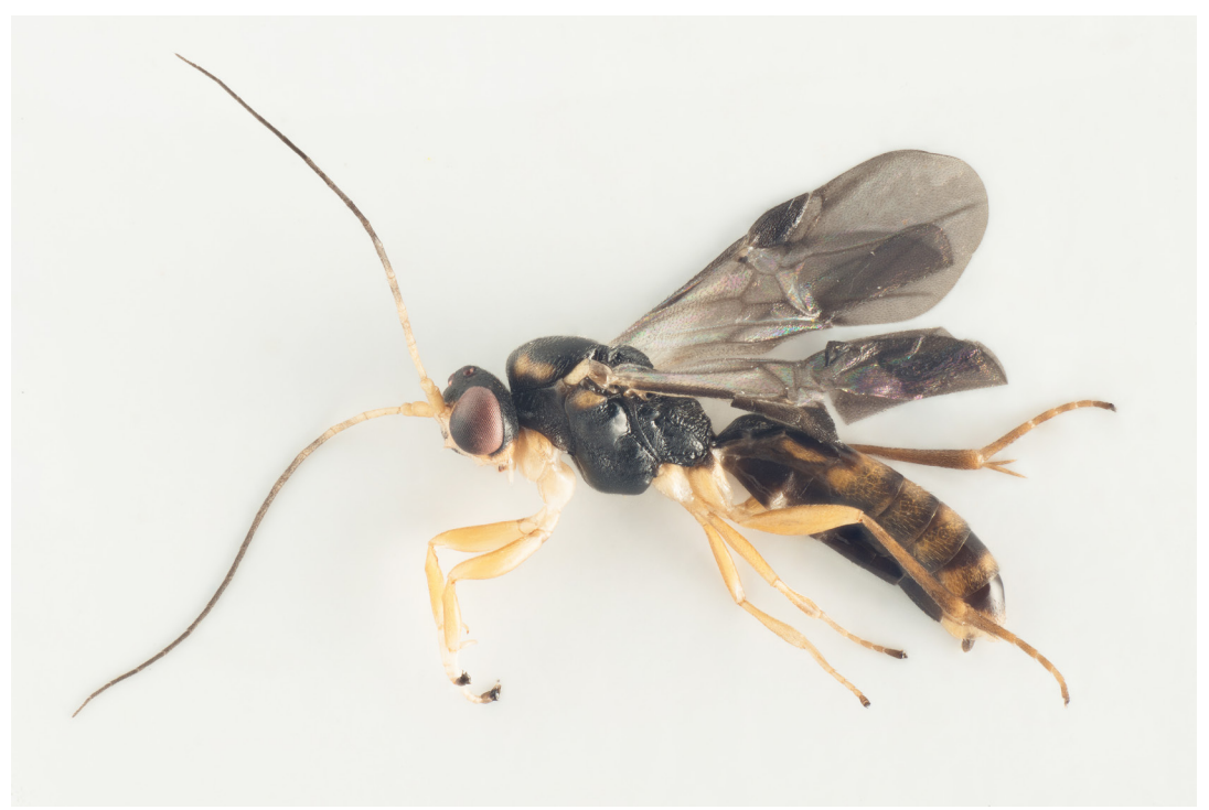
FIGURE 4. Neoneurus clypeatus (Foerster, 1862), female, from Malvik in Sør-Trøndelag, Norway.