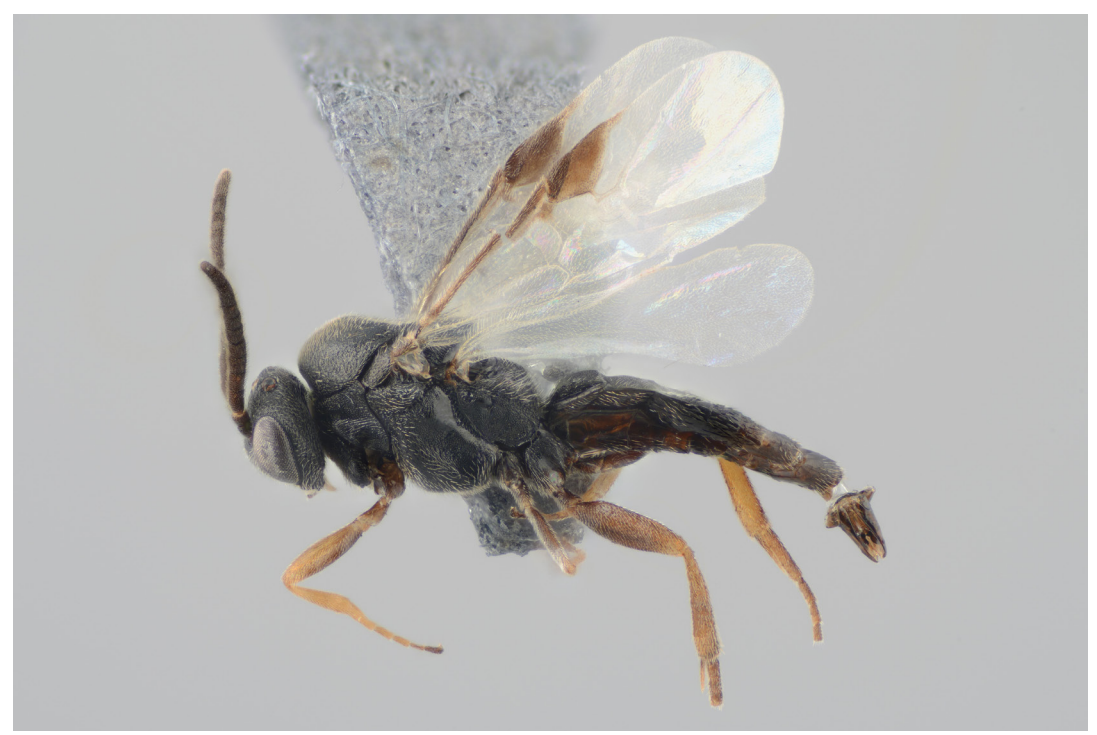
FIGURE 2A. Elasmosoma berolinense Ruthe, 1858, male. From Lier in Buskerud, Norway.