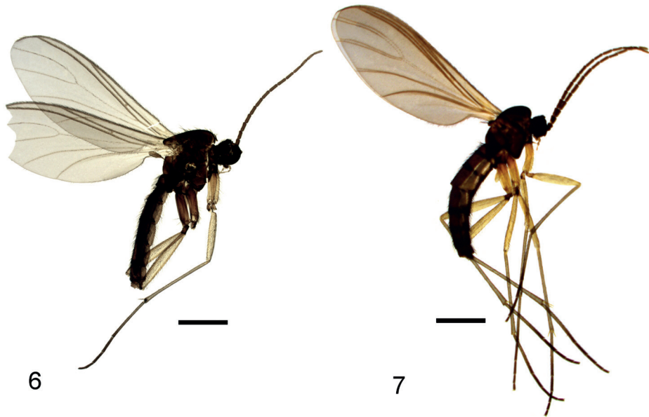
FIGURES 6–7. Habitus. 6. Lectotype of Trichosia edwardsi (Lengersdorf, 1930). 7. Trichosia lengersdorfi sp. n. Scale bars 1.0 mm

Riedlhütte, NP Bavarian Forest, forest, 48.951° N, 13.422° E, malaise trap, 18.V.2012, leg. Sellmayer (BIOUG05208-D01, ZSMC) 1 male; Berlin , Berlin, Grunewald, 52.469° N, 13.229° E, photoeclector, V.1995, leg. I. Späth (no. 2144, SDEI) 1 male; V.1994, leg. I. Späth (no. 2174, SDEI) 1 male; IV.1995, leg. I. Späth (no. 2173, SDEI) 1 male; V.1900, leg. L. Oldenberg (no. 2130, SDEI) 1 male; 06.V.1906, leg. L. Oldenberg (no. 2132, SDEI) 1 male; 25.IX.1899, leg. L. Oldenberg (no. 2131, SDEI) 1 male; Berlin-Friedrichshagen, old pines, 52.455° N, 13.616° E, V.1994, leg. G. Möller (no. 2133, SDEI) 1 male; IV.1995, leg. G. Möller (no. 2138, 2142, 2143, 2162, SDEI) 4 males; VI.1994, leg. G. Möller (no. 2176, SDEI) 1 male; 09.VII.1993, leg. G. Möller (no. 2179, SDEI) 1 male; 14.V.1993, leg. G. Möller (no. 2166, SDEI) 1 male; Berlin-Treptow, forest district Müggelheim, 52.479° N, 13.477° E, photoeclector, V.1995, leg. G. Möller (no. 2141, 2178, SDEI) 2 males; pitfall trap, V.1995, leg. G. Möller (no. 2182, SDEI) 1 male; IV.1995, leg. G. Möller (no. 2170, 2180, SDEI) 2 males; 14.V.1993, leg. G. Möller (no. 2189, SDEI) 1 male; Brandenburg , Bremsdorf, Schlaubetal Kr.