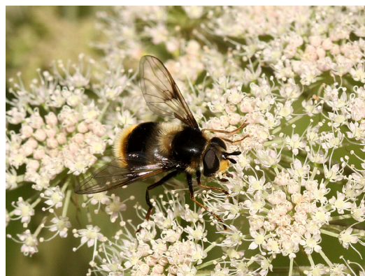
FIGURE 3. Eriozona syrphoides (Fallén, 1817) female.

Remarks. The male from Sigdal was determined by A. Vujič. New to the Norwegian