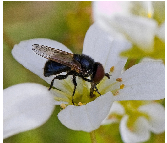
FIGURE 6. Psilota atra (Fallén, 1817), a rare species with the larva associated with decaying sap in rotten trees.