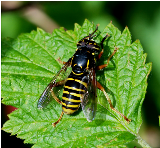
FIGURE 7. Spilomyia manicata (Rondani, 1865), recognizable by its black fore tarsi.