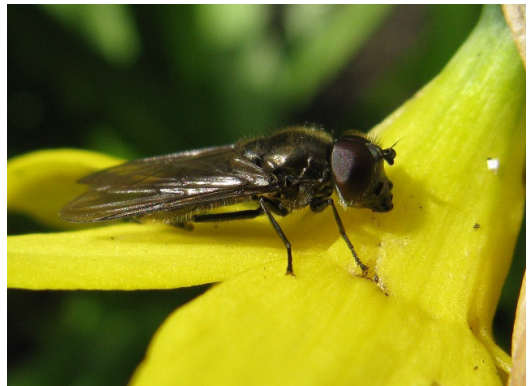
FIGURE 2. Cheilosia semifasciata (Becker, 1894) male.