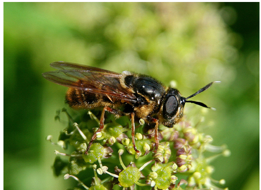
FIGURE 1. Callicera aenea (Fabricius, 1781) female in Angelica archangelica flower. Lindesnes: Remesvik 18 June 2013.