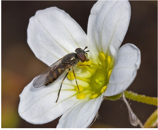
FIGURE 17C. Platycheirus transfugus (Zetterstedt, 1838) female.