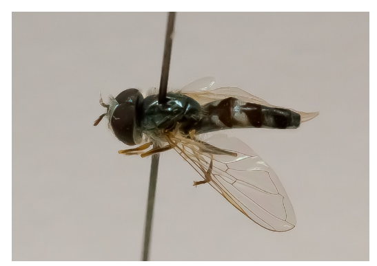
FIGURE 14. Platycheirus metallicus Barkalov & Nielsen, 2004 male.

Distribution . A circumpolar species: North Siberia, North Europe, North America, Greenland.