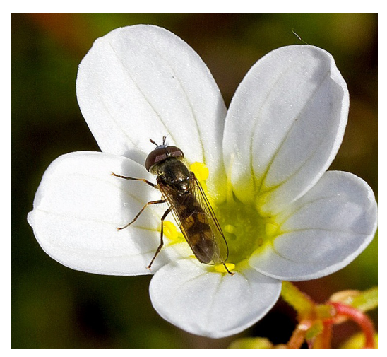
FIGURE 17A. Platycheirus transfugus (Zetterstedt, 1838) male.

Distribution: northern and central Europe, Kazakhstan, Middle Asia, Mongolia, Russia.