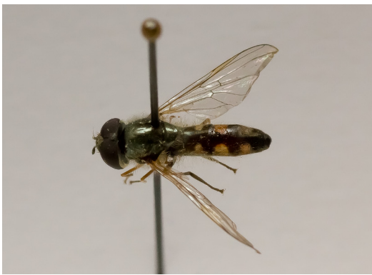
FIGURE 8A. Platycheirus fimbriatus (Loew, 1871) male.