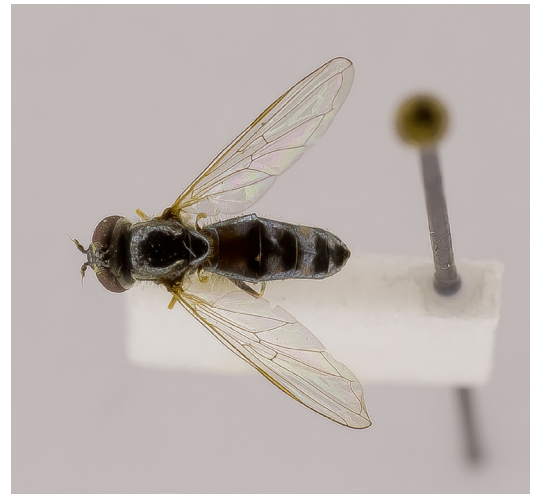
FIGURE 1B . Platycheirus arnei sp. n., female paratype.

great source of inspiration in entomology.