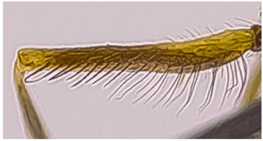
FIGURE 4B. Platycheirus ambiguus (Fallén, 1817) male fore femur.