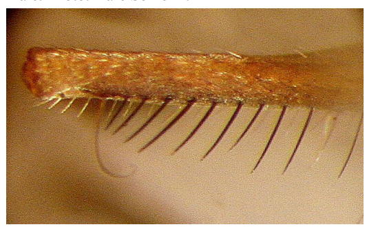
FIGURE 8B . Platycheirus fimbriatus (Loew, 1871) male fore femur.. western mountains to California and New Mexico.