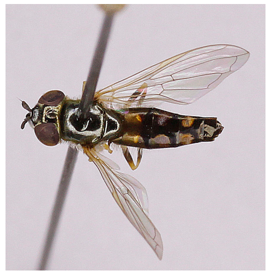
FIGURE 16B. Platycheirus pusillus Nielsen & Romig, 2010 female paratype.