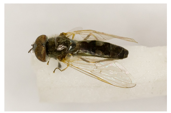
FIGURE 13 . Platycheirus meridimontanus Nielsen, 2004 male paratype.