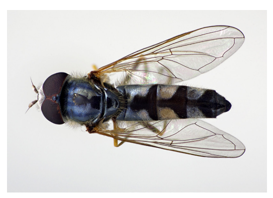
FIGURE 18. Platycheirus tuvaensis B arkalov & Nielsen, 2008 male paratype.