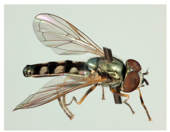
FIGURE 16A. Platycheirus pusillus Nielsen & Romig, 2010 male holotype.