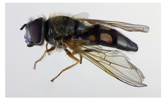
FIGURE 10A. Platycheirus kelloggi (Snow, 1895) male.