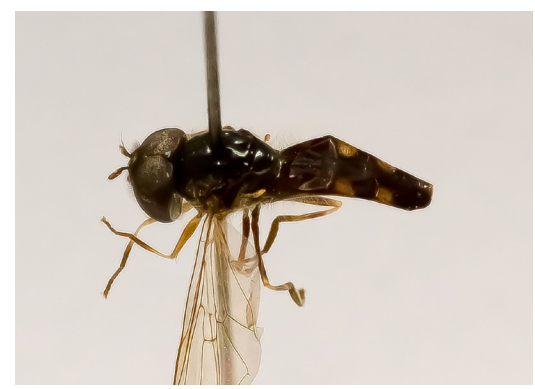
FIGURE 6A . Platycheirus brunnifrons Nielsen, 2004 male paratype.

Female (based on a single specimen). Frons shining bluish black with two triangular grey dust spots, together covering 2/3 the width of frons. Legs with femora 1-2 orange yellow, femur 3 with a broad black ring in the middle. Tibia 1-2 grey on their distal half, tibia 3 on the distal two thirds. All tarsi grey. Wing with base, stigma and veins yellow. Haltere and its knob yellow. Abdomen with tergites 2-4 each with a pair of orange brown