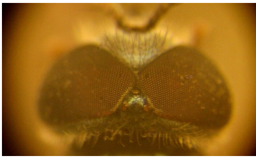
FIGURE 9B. Platycheirus kashimiricus Nielsen, 2004 male holotype holotype, head in dorsal view.