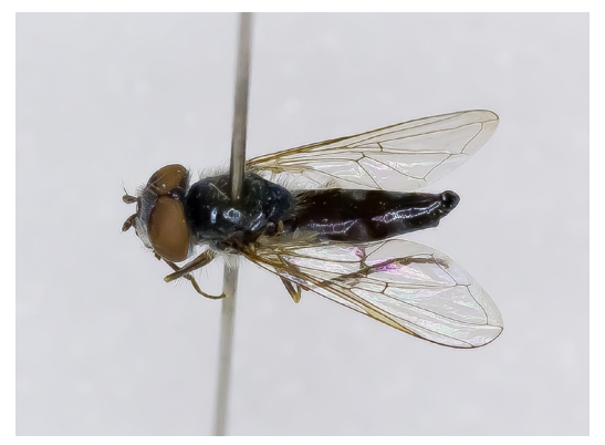
FIGURE 3 . Platycheirus altomontis Nielsen, 2004 male paratype.

Distribution . High mountains of northern Italy.