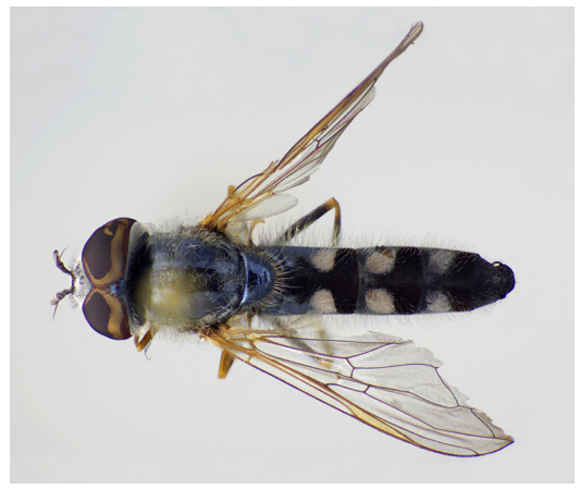
FIGURE 2 . Platycheirus abruzzensis (v.d. Goot, 1969) male paratype. Photo: Karsten Sund (NHM, Oslo).

Additional material. 2 3 3 2 9 9 paratypes