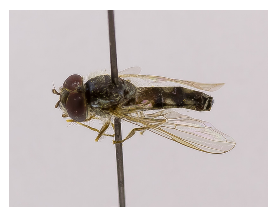
FIGURE 12. Platycheirus lundbecki (Collin, 1931) male.

hairs ligth yellow. Sternites black, dulled by light whitish dusting.