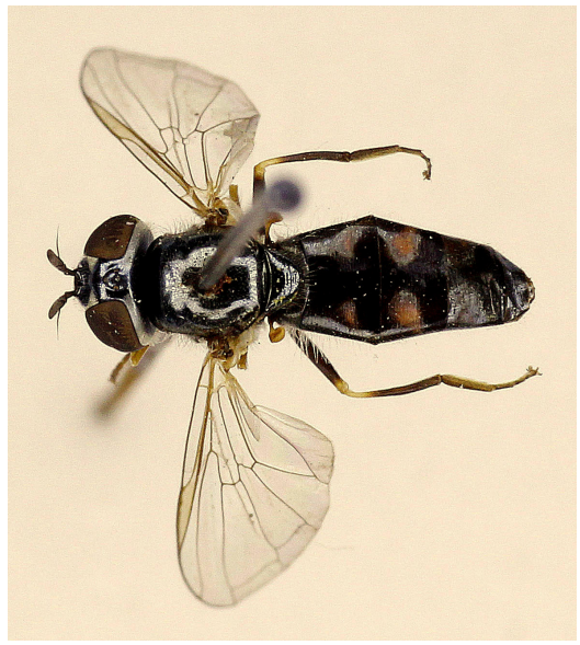
FIGURE 6B. Platycheirus brunnifrons Nielsen, 2004 female.

oblique spots, their margins shining metallic blue.