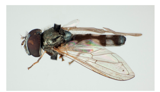
FIGURE 1A . Platycheirus arnei sp. n., male holotype.