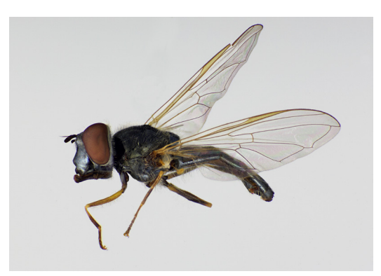
FIGURE 11A . Platycheirus longicornis Peck, 1979 male paratype.