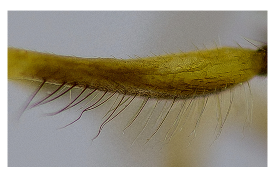
FIGURE 17B. Platycheirus transfugus (Zetterstedt, 1838) male fore femur.