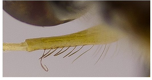
FIGURE 5B. Platycheirus barkalovi Mutin, 1999 male fore femur.