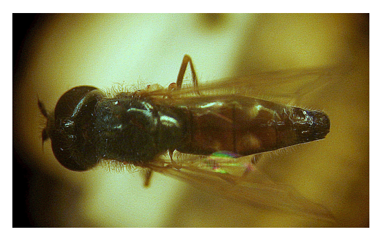
FIGURE 9A. Platycheirus kashimiricus Nielsen, 2004 male holotype.