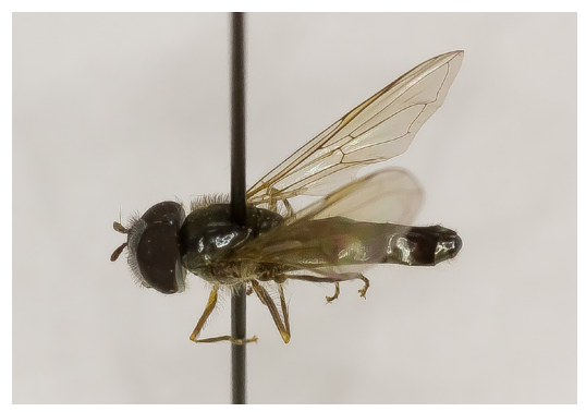
FIGURE 4A. Platycheirus ambiguus (Fallén, 1817) male.

Diagnostic characters. Medium sized species, similar to P. ambiguus but with yellow basitarsus of fore and often mid legs, differing distinctly from the other darker tarsal segments. Male: eye angle 90°. Fore tibia postero-laterally in the middle with a few hairy bristles that do not quite reach the tip of tibia. A diagnostic character for this species is the setae on the posterior surface of fore femur which are slightly dilated and flattened