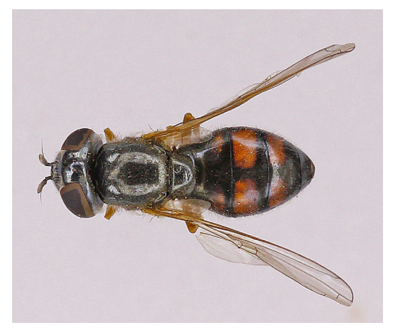
FIGURE 10B. Platycheirus kelloggi (Snow, 1895) female.