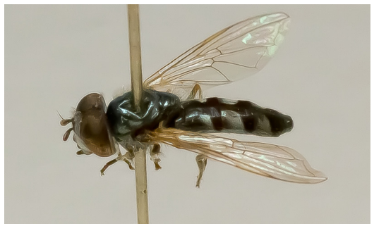
FIGURE 7. Platycheirus caesius Nielsen, 2004 male paratype.

Distribution . High mountains of northern Spain and of Switzerland (2200–2600 m.a.s.l.).