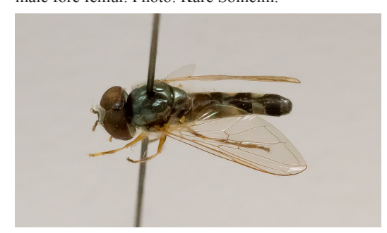
FIGURE 5A. Platycheirus barkalovi Mutin, 1999 male paratype.