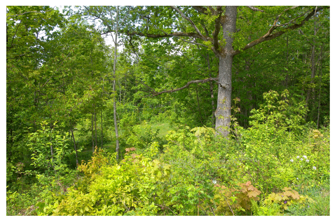
FIGURE 2 . The mixed deciduous forest around Natursenteret at VE Borre (EIS 19) where Temnothorax nylanderi (Förster, 1850) was recorded. Photo: T. Kvamme.

easily overlooked (e.g. Czechowski et al. 2002). The typical habitats are deciduous forests with a good layer of litter, but it can also establish colonies in other forests types. The colonies are monogynous or polygynous (Czechowski et al. 2002, Seifert 2007) with up to 150 workers (Collingwood 1979) and are most commonly found under rather deep set stones. The species prefers shaded habitats. In Sweden S. debile is known from Skåne, Gotland and Vestergötland counties (Douwes 1995).