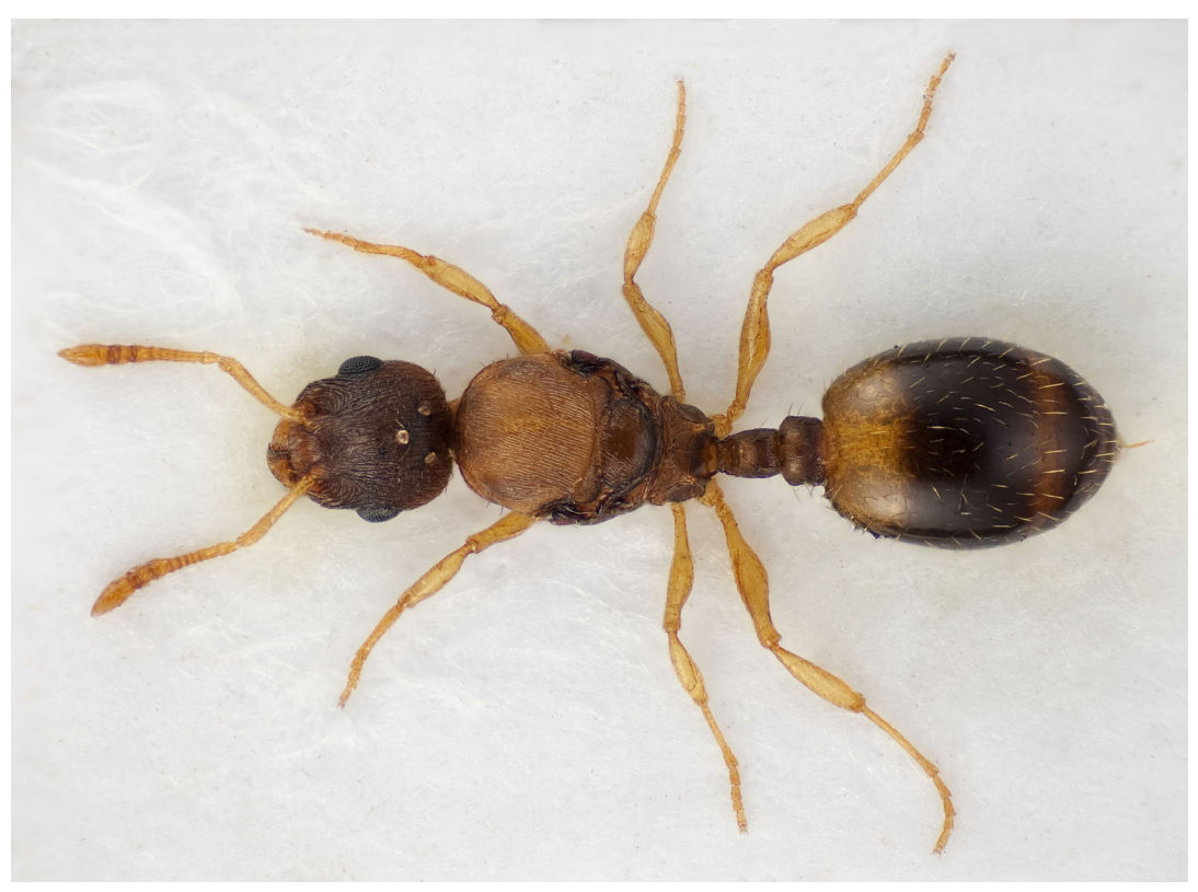
FIGURE 1 . One of the single queens of Temnothorax nylanderi (Förster, 1850) collected at VE Borre: Natursenteret in Horten (EIS 19).

S. debile has a very cryptic mode of life. In addition the ants are small, move slowly and roll together when disturbed. The species is therefore