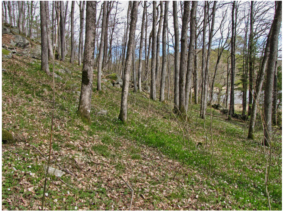
FIGURE 4. The oak stand at VAY Kristiansand: Nedre Timenes (EIS 2) in spring, where Stenamma debile (Förster, 1850) was recorded. The fjord Drangsvann can be seen behind the trees.