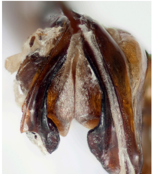
FIGURE 6. Sting sheet of Bombus subterraneus (L., 1758).

DNA was extracted from internal fragments collected from the dissected genitals, using the E.Z.N.A. ® MicroElute ® Genomic DNA Kit (Omega Bio-Tek Inc., Norcross, GA, U.S.A). A partial CO1 fragment from the mitochondrial genome was amplified by PCR using primers originally developed for Apis mellifera (Tanaka et al. 2001). Primer sequences were: 5'-ATAATTTTTTTTATAGTTATA-3' (forward) and 5'-GATATTAATCCTAAAAAATGTTGAGG-3' (reverse). PCR amplification was performed in a 30 µl reaction containing 2.25 mM MgCl 2 , 0.2 mM of each dNTP, 9.6 pmol of each primer, 1.5 µg of Bovine Serum Albumine (BSA), 0.9 units of HotStar DNA polymerase (Qiagen, GmbH,