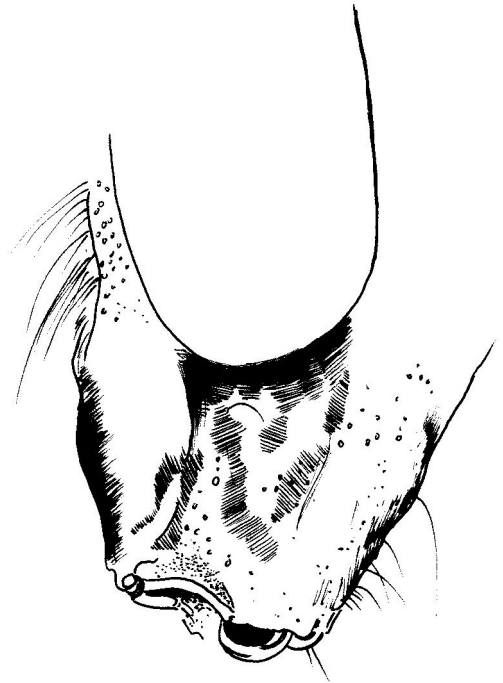
FIGURE 3. Bombus subterraneus (L., 1758). Head. Face profile.