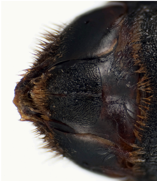
FIGURE 5. Bombus subterraneus (L., 1758). 6 th sternite: keel.

in general the new specimen was very similar to the museum-specimens of the species B. subterraneus . Some characters differed, though, like the distinctness and transparency of the keel and the amount of punctuation on clypeus: The museum specimens had a more distinct keel, and it was transparent, but this trait may be caused by fading in old specimens. In addition, the museum specimens exposed an almost unpunctuated clypeus, compared to the sparsely punctuated clypeus of the new specimen.