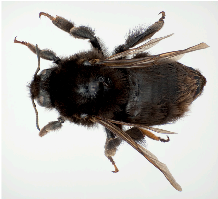
FIGURE 1. Bombus subterraneus (L., 1758), the new specimen.

The first Norwegian record dates back to 1880 (Siebke) from the location Oslo confirmed by Løken (1973). All confirmed specimens are summarized in Table 1. The presented specimen is a dark B. subterraneus queen, collected by the first author on 3 June 2010 in Hobøl Municipality, Østfold County (EIS 29).