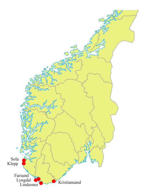
FIGURE 1 . Observations of migrating Helophilus trivittatus in Norway in 2010.