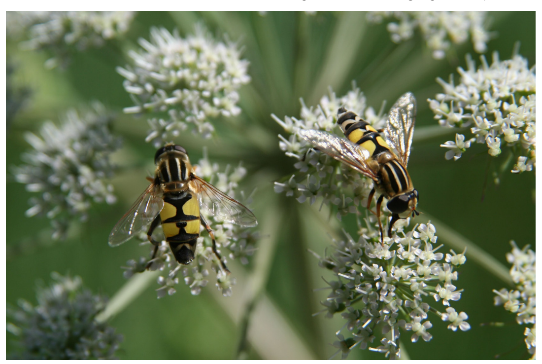
FIGURE 2 . Helophilus trivittatus , male (left) and female (right) in Angelica sylvestris flower. Aunevik, Lyngdal 22 July 2010.

It is interesting to note that also in the Netherlands (Waarneming n.d.), multiple specimens of H. trivittatus were reported in July–August (amongst numerous reports of single specimens). Noteworthy are the following reports: 13 July: 35 specimens in Groningen province (Northeast