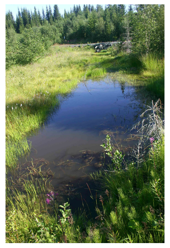
Figure 3. Habitat of Notonecta glauca (Pond 1), Tiller, Trondheim.

N. glauca occurs here in dystrophic, mesotrophic and eutrophic lakelets and ponds from sea level up to 200 m (Table 1). The term "pond" is used for localities with a surface area up to about 2500 m^2 and a "lakelet" is usually slightly larger. The species has also been recorded in farm ponds, moorland ponds, garden ponds, woodland ponds and one slowly-flowing stream. N. glauca may also be present in small, shallow eutrophic ponds