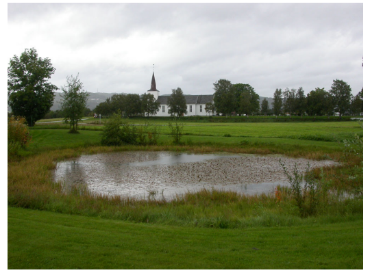
Figure 4. Habitat of Notonecta glauca , Rissa.

close to the sea and fertilized by seaweed and frequently visiting seagulls. Figures 3–5 show different types of locality for N. glauca . These habitats strongly resemble those described by Coulianos et al. (2008), who say that N. glauca