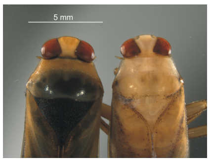
Figure 1 . Notonecta glauca (left) and N. lutea .

which comprises the three counties of Møre & Romsdal, Sør-Trøndelag and Nord-Trøndelag, were in two small ponds in Kristiansund in the mid-1970s (Dolmen & Olsvik 1977). In 1984–86, it was found in high densities in four ponds in and near Trondheim, one at the Ringve Botanical Gardens, a nearby pond called Madsjø, and two neighbouring ponds at Udduvoll (Dolmen 1989b, Figure 2). The Ringve pond was dug out in 1976 and various plants were later introduced into it from, for instance, Bergen, Oslo and Central