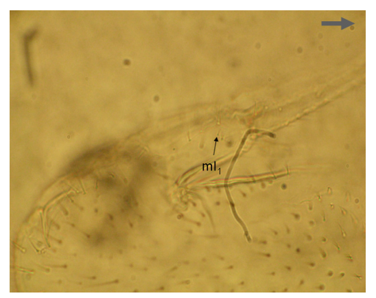
Figure 2. Left side of abd.3-6 with manubrial seta ml_1 marked by arrow. Thick arrow points towards head.