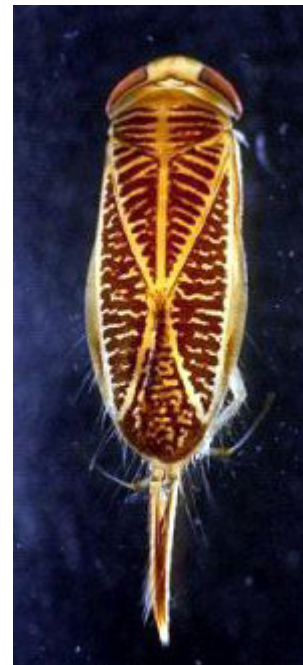
Figure 2. Sigara hellensii.

12. Sigara hellensii (C.R. Sahlberg, 1819). Two older records of this species are known from Norway, viz. river Risa in Eidsvoll municipality