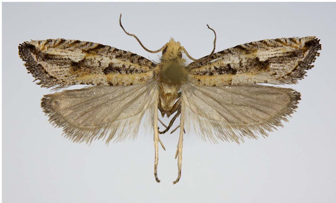
Figure 3. Imago of Bactra endea Diakonoff.