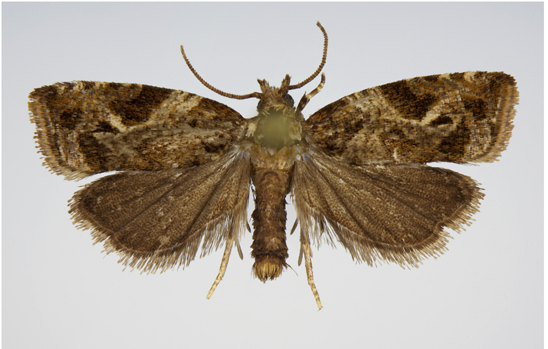
Figure 4. Imago of Syntozyga triangulana sp. n.

to form a median and two lateral spout-like folds, plates at the foot of ostium are standing upright and are much more sclerotized, the caudal edge of the eight segment is more distinctly modified". The discovery of the male confirms the close affinity between B. angulata (Diakonoff 1956, fig. 23) and B. endea (Figure 7). They are so close that without the evidence of the female (see above), I would not hesitate to consider B. endea and B. angulata as conspecific. The only difference noted in the male genitalia is the presence in endea of a strong spine low on the outer edge of cucullus. This is lacking in B. angulata . Because males and females of B. endea never have been found together, the identity of the males of B. endea published here, is based on the indirect evidence of the close relation with angulata . In the future, when more material becomes available, further study may show that the two taxa, B. angulata and B. endea , should be separated on the subspecific level only. The slender cucullus separates B. endea from all other African species of the subgenus Chiloides .