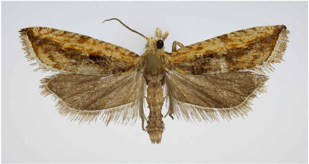
Figure 1. Imago of Bactra helgei sp. n.

L. Aarvik leg., genital slide 2222 L. Aarvik, coll. NHMO.