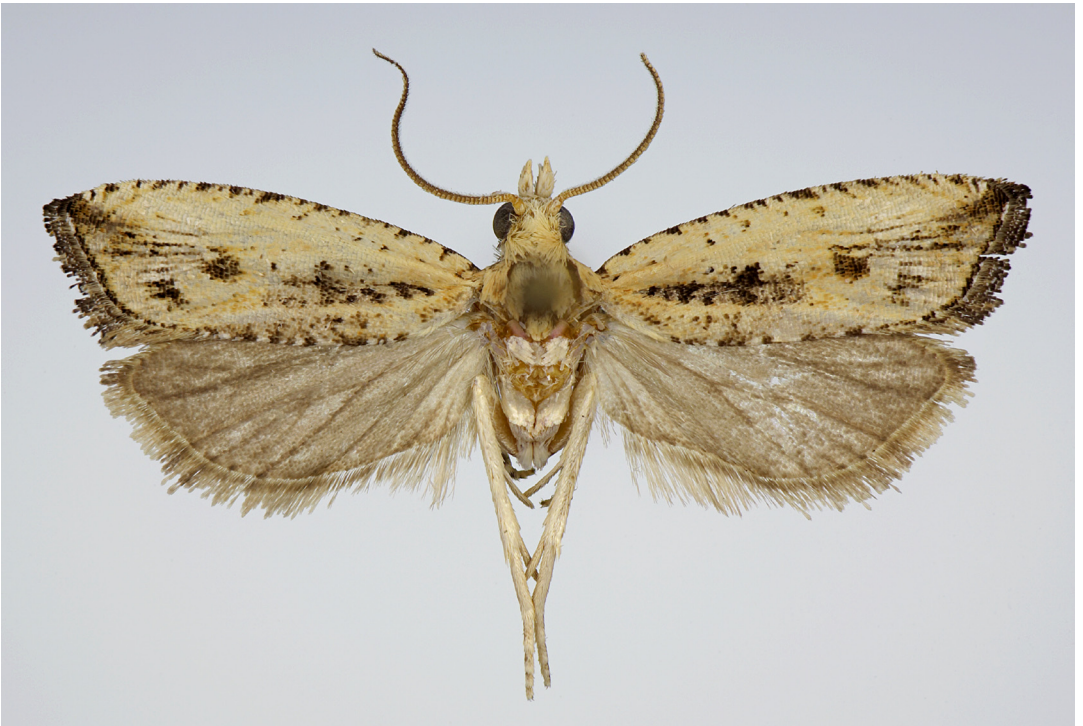
Figure 2. Imago of Bactra magnei sp. n.

1.VI.1992 L. Aarvik leg., genital slide 2223 L. Aarvik, coll. NHMO.