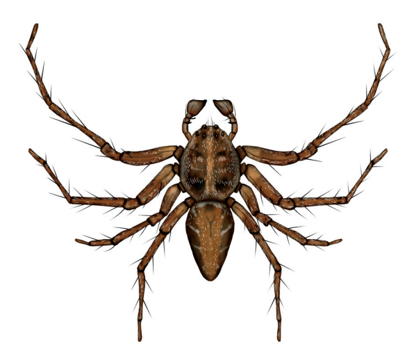
Figure 2. O. ramosus – habitus. Drawing: Kjetil Aakra.

redlisted in Norway as VU (vulnerable), based on current IUCN criteria (Kålås et al. 2006).