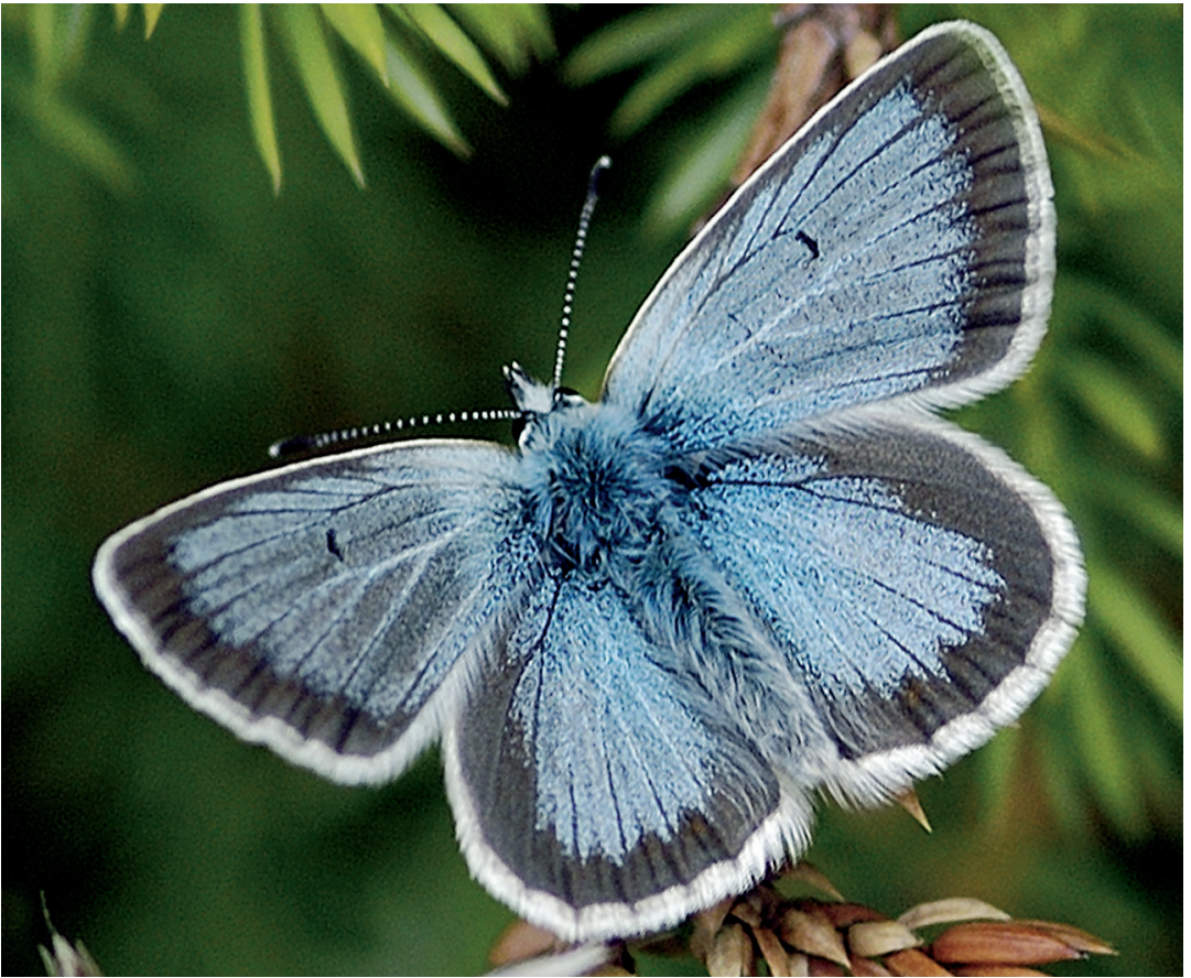
Figure 2. The upperside of a Silvery Argus male, showing the characteristic features. Skutskär, Uppsala, Sweden 11 July 2004. Photo: Bo Söderström (from Söderström 2006).

2005). The behaviour of other development stages in Fennoscandia is unknown.