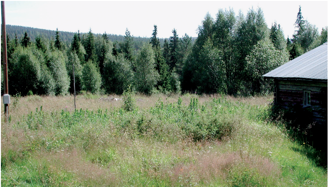
Figure 4. The site Gullsetmora in Ljørdalen 26 July 2006, when and where the species was found for the first time in Norway. The lack of cultivation, but still fairly open character, is evident.

three localities where it was found, indicating that there may be space for a self-sustaining population. It is mostly the areas east in Trysil that are close to the known Swedish distribution, but fairly isolated populations are known from Sweden (Gärdenfors 2005). Wood Cranesbill is one of the most common plants in Norway (J. Wesenberg, pers. comm.). It is therefore difficult to envisage that this or other plant species could be limiting factors, while climate and general vegetation geography appear as more likely explanations, also taking into account major changes in the cultural landscape.