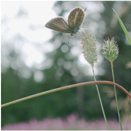
Figure 3. The wing undersides are very similar for both sexes, and the wedge-shaped and dirty-white stroke clearly passing the disc spot is species diagnostic. Female at Skaftet, Ljørdalen 26 July 2006.

than a hectare on each) have not been grazed or mowed for several years, and the Wood Cranesbill population is substantial.